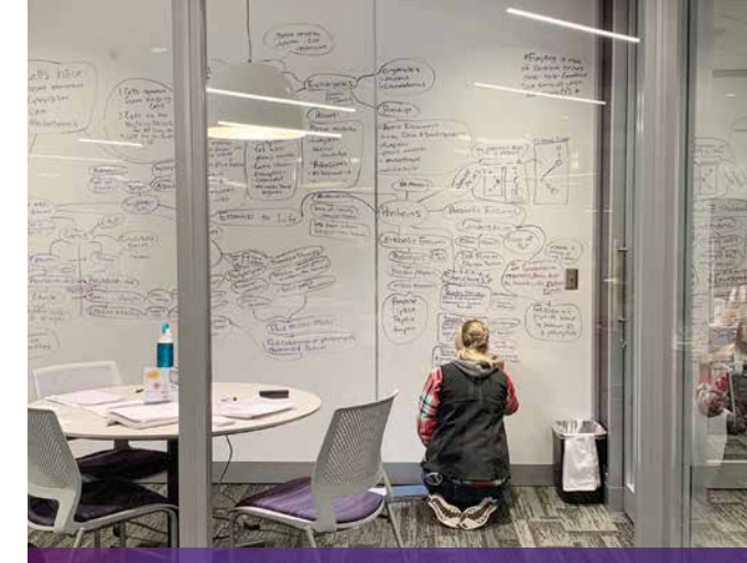
A student fills an entire whiteboard wall with a diagram about cell structure and function for her biology class.

They aren't the only students with a ringing endorsement.