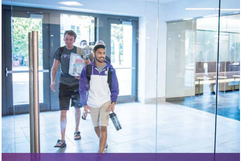
On August 28, the doors to Hale Library opened for the first time in 15 months. The new entrance opens directly onto Hale's first floor.

school in the near future. They were Hale Library regulars in their earliest years at K-State, and they felt its loss.