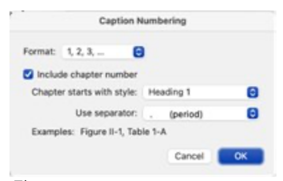
Figure 1.2. Initial Caption formatting setup

Once you have this set up, you can use this caption tool quickly to add captions to figures and tables in your document.